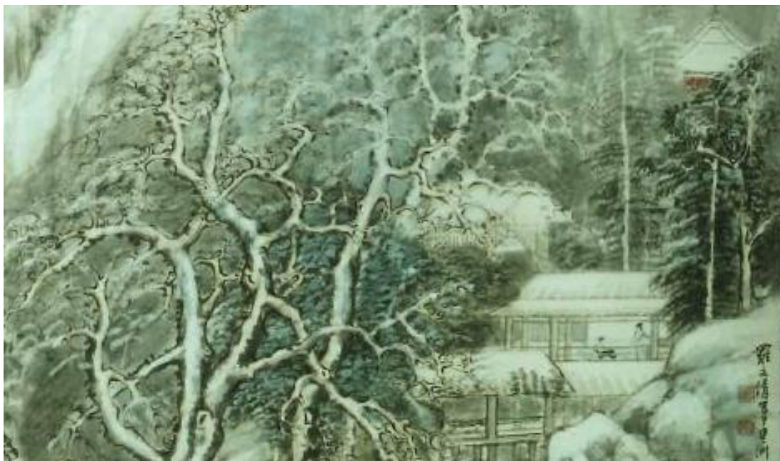
Figure 2. Title: 'Lonely Tune' artwork by the researcher-artist

Engaging in discussion with the artist was a valuable way of starting the intercultural workshops in this case study. The case study then moves into its second phase in the 'Mo-ku-chi' model of 'creativity' where the participants are exposed to an imaginary narrative. The purpose of this narrative is to stimulate participants' imagination. This research segment is influenced by the Vygotskian framework and the works of Brooks (2002). Vygotsky (1962) proposed that it is in "word meaning" (p.5) that thought and speech join together to become verbal thought. It is through the practice of imagining and drawing that we can learn to understand children's thinking processes (Brooks, 2002; Narey, 2009). Vygotsky saw that there were two forms of meaning, 'meaning as abstractions' and 'meaning as personal contextualized sense' (Wertsch, 2000) and if teachers understood the difference between these two ways of thinking then they would be able to encourage children in their 'creativity'. Based on Brook's theory (Brooks, 2002; 2003) that drawing assists the movement from invisible to visible thought became the basis of phase two.