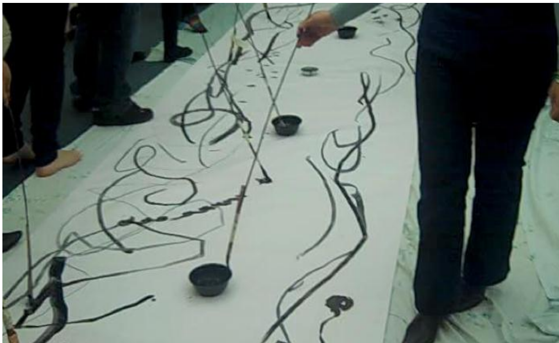
Figure 3. Mo-ku ink-splash method allows the materials to lead you... Pre-service students in the intercultural workshop using Chinese black ink, Chinese brushes on long bamboo sticks.

I can say from my experience being a Sri Lankan person, you're taught that art is not important. And it's just an eye-opener like people need to be aware that art is just not drawing. It means so many different things, and how it can be integrated. It's so important you have to think about your different learners if you're a teacher, engaging your children with different abilities and, how you can use so many different forms, it's not just the four strands of creative arts that help the kids with everyday life (NV10).