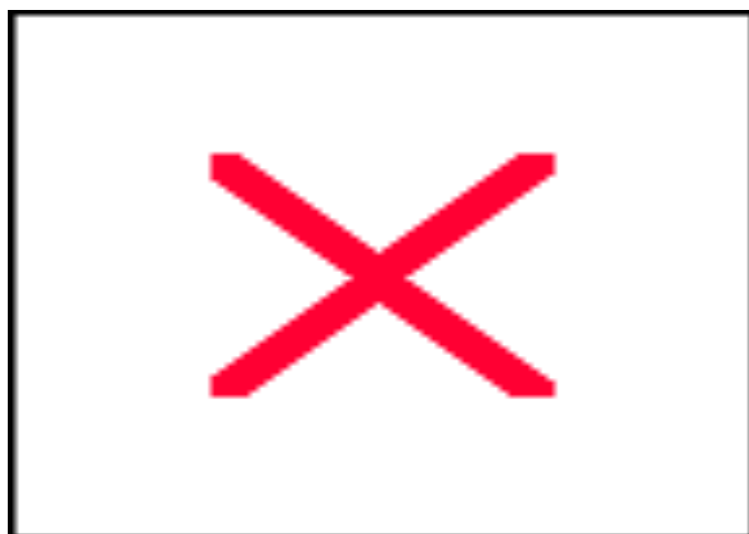
Figure 2: Textual sources related to dimensions of discourse

The 'text' under examination in our study is the curriculum document, or selected parts of it, such as statements of curriculum content. However, as this is an historical study, the discursive practices and social practices which relate to that text are not available for immediate observation. We must rely on other 'texts' and artefacts to access these processes and broader discursive formations. Figure 2 shows how we are using textual sources to consider the discursive practices and wider social practices related to the text under consideration.